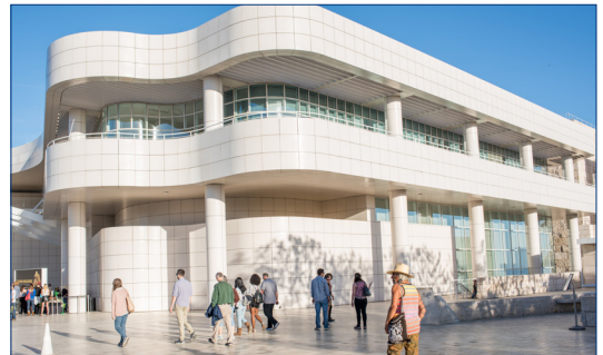
The worlds most beautiful structures count on Alloy Fasteners with AllGuard.